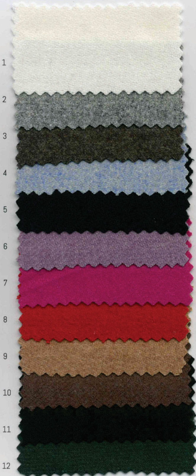
Fabric 10 mtr. folded