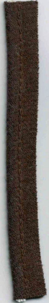
Paspoil 22/11 mm