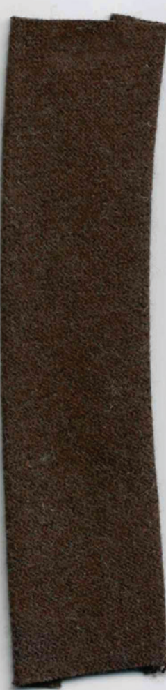
Bias binding 44/25 mm